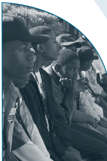
Cover picture © Oryxmedia

ISSN 0258 - 8927 • VOLUME 23 No. 10 • OCTOBER • 2005